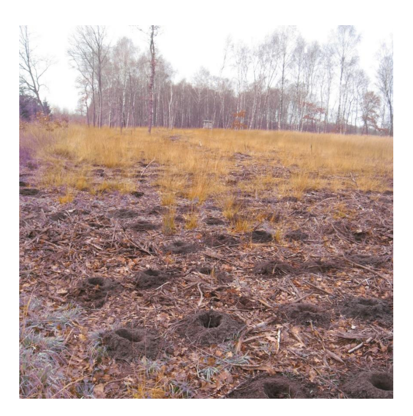
Abb 1: The area in Hohenaspe shortly before the planting in November 2021